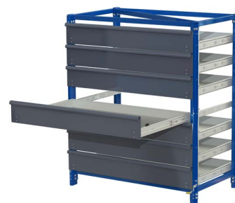
Pull-out rack with 7 drawers, 1 drawer pulled out