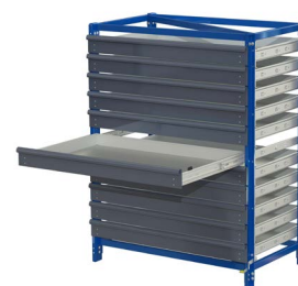
Pull-out rack with 11 drawers, 1 drawer pulled out