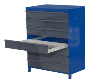
Pull-out rack with 7 drawers with optional metal cladding