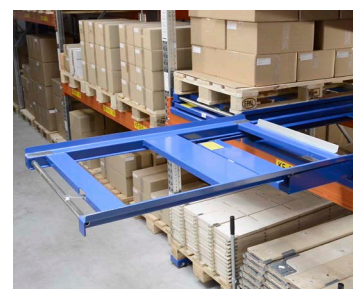
Built-in pull-out unit