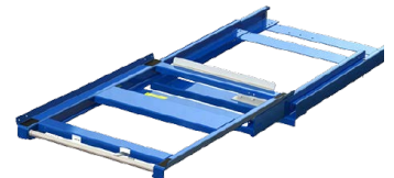
Full extended pull-out unit