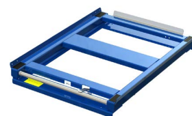
Closed pull-out unit