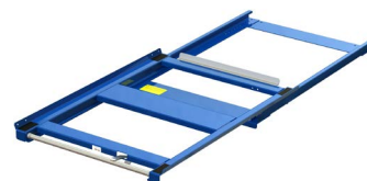
Full extended pull-out unit