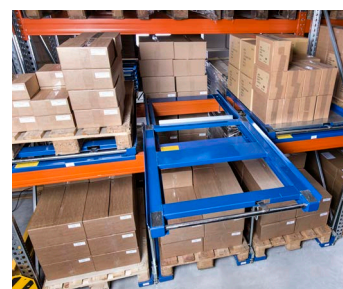
Built-in pull-out unit