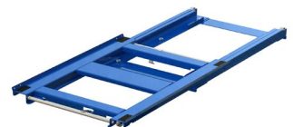
Full extended pull-out unit