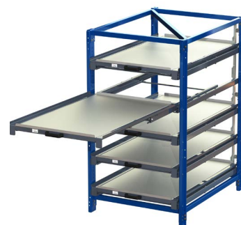
Empty pull-out rack with extended drawer