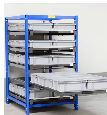
Loaded pull-out rack with 5 drawers