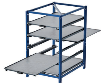
Empty pull-out rack with 2 extended drawers