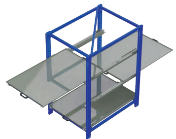
Pull-out rack with 3 drawers, 2 of them extended