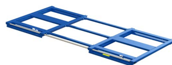
Closed pull-out unit