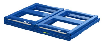
Closed pull-out unit